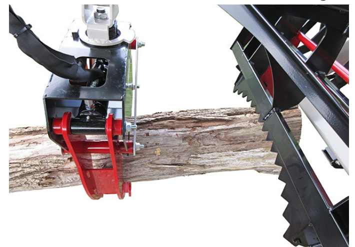
If the power unit feels unstable after lifting the log, lower the log to the ground and cut it into smaller sections.

Tilt the log grapple so the grapple arm tube is approximately parallel to the ground. Drive over the end of the log until the teeth on the lower frame are 5-10 cm (2-4 inches) past the end of the log. Open the grapple claw and lower the loader arms until the grapple claw can be closed around the log. Close the grapple claw until it has a good grip on the log. Raise the loader arms to lift the end of the log up against the teeth on the lower frame. Tilt the grapple frame back and/or raise the loader arms to raise the far end of the log.